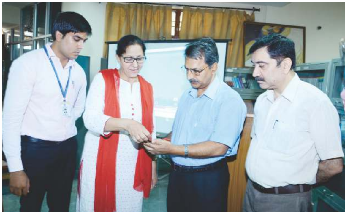
Launching of Mobile Application - DDEKUK