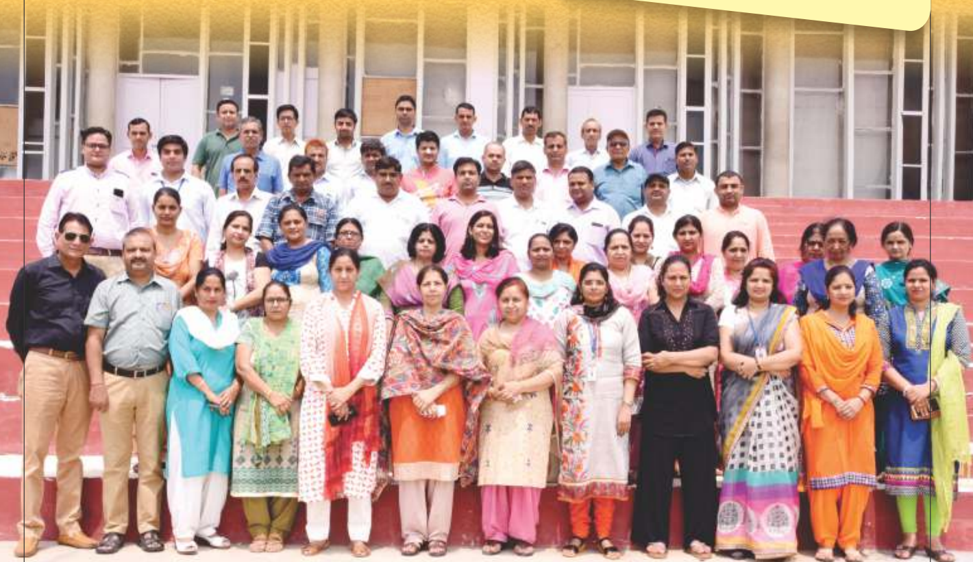
Team of Directorate of Distance Education, Kurukshetra University, Kurukshetra

To evolve a seamless system of higher distance education for sustainable life-long learning and up gradation of knowledge and skills by use of innovative approaches.