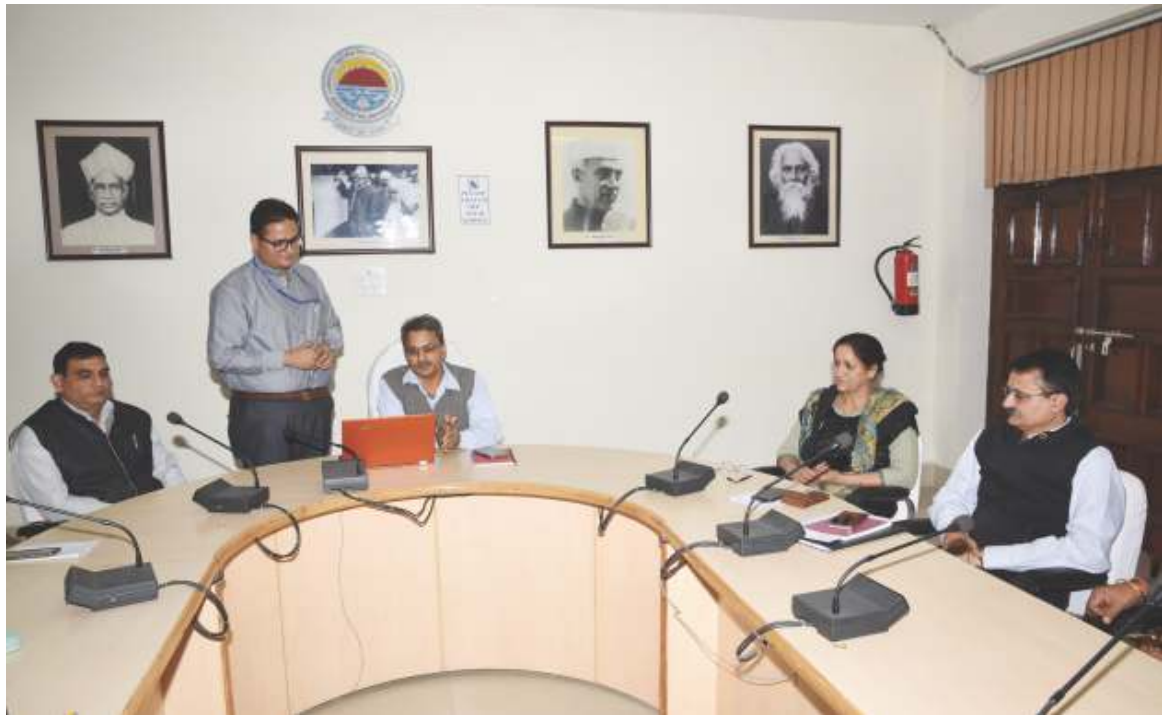
Launching of Bulk SMS Service of Directorate